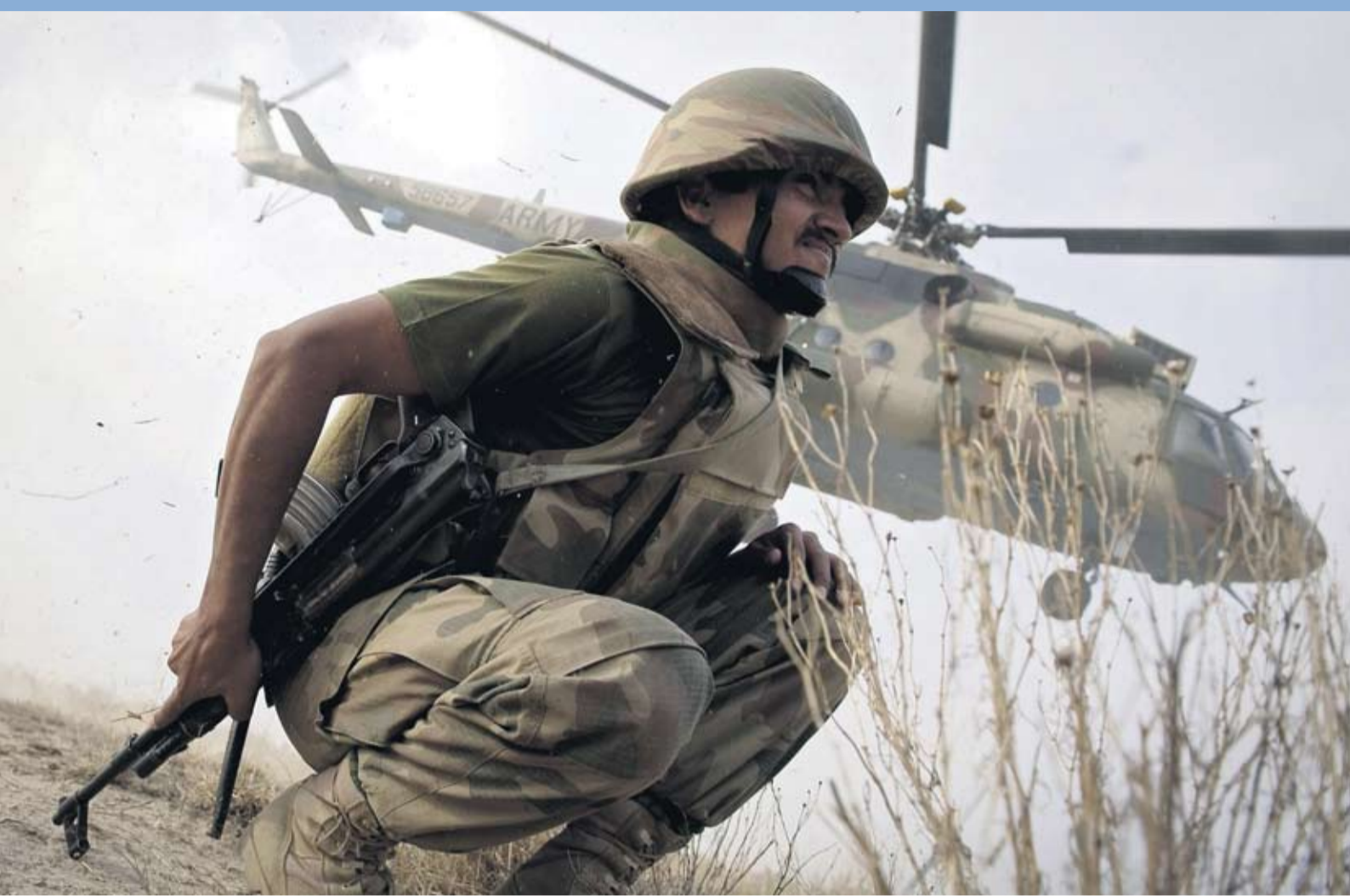
A soldier crouches on a mountaintop near Kotkai two weeks into the campaign against Taliban and al Qa'eda fighters in South Waziristan.