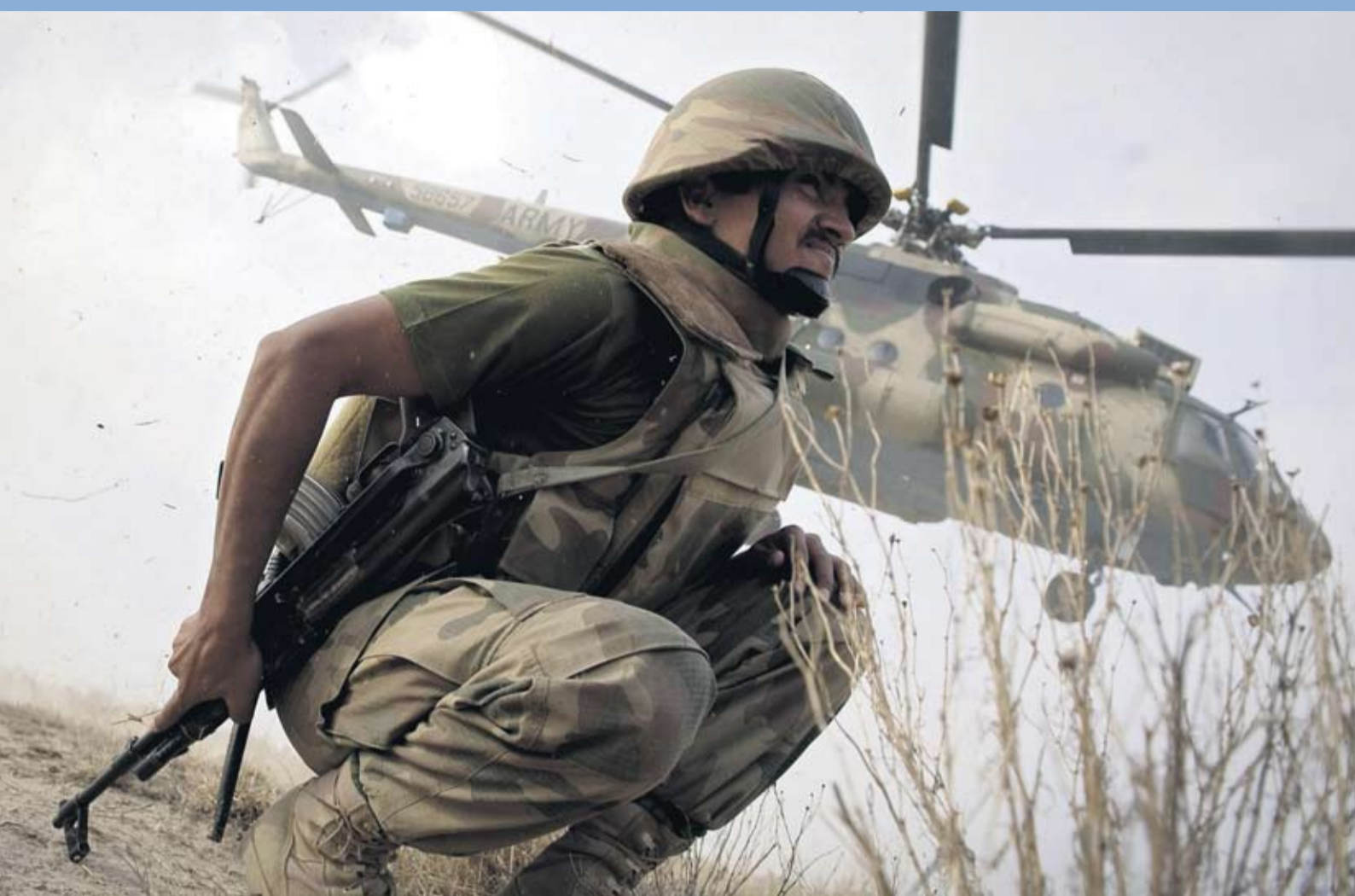
A soldier crouches on a mountaintop near Kotkai two weeks into the campaign against Taliban and al Qa'eda fighters in South Waziristan.