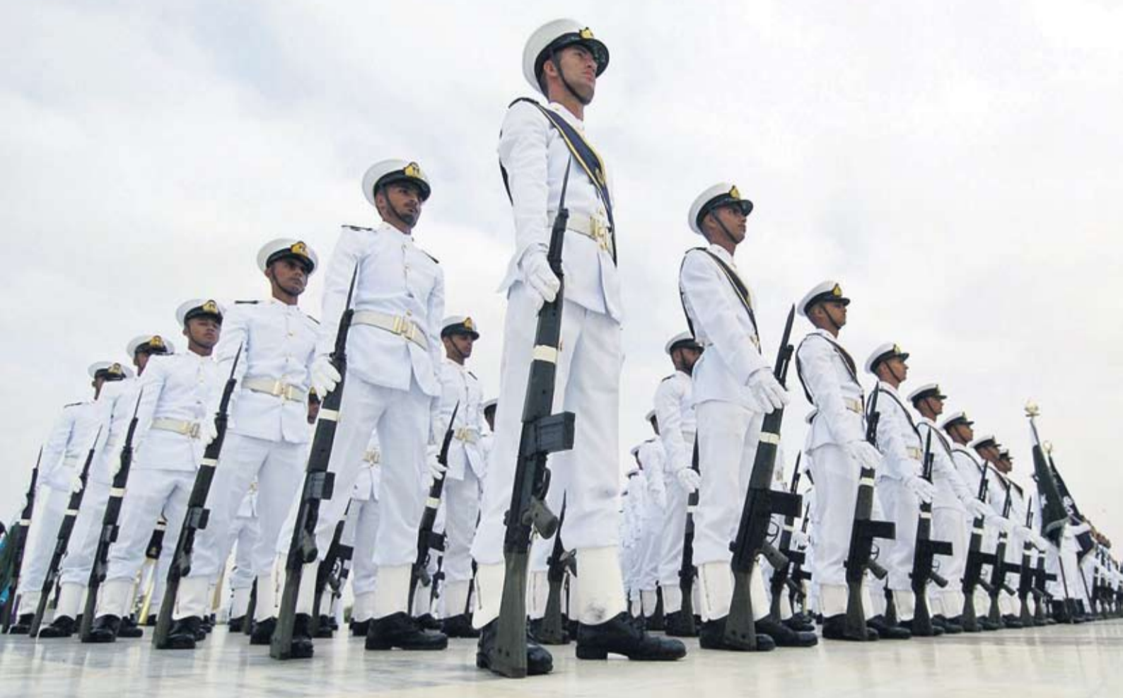
The Taliban, who number in the low tens of thousands, face a Pakistan army with an active force of more than 500,000 personnel.